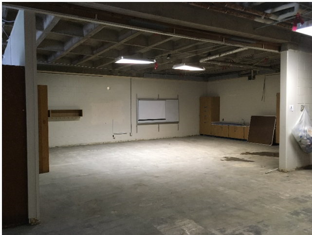
Flooring, ceiling tile, and duct removal