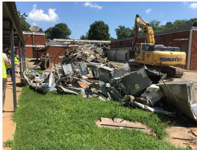
Began vertical demolition of building